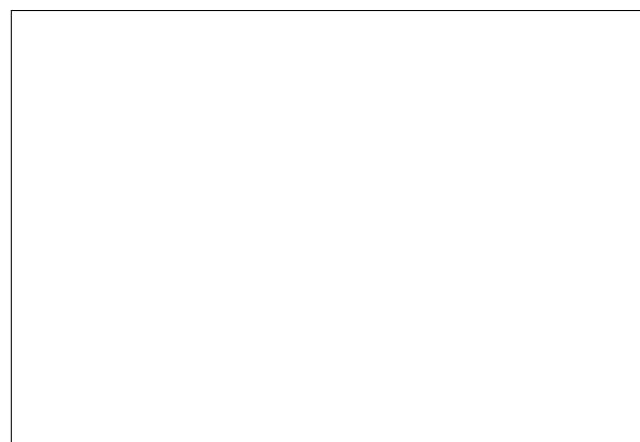
Figure 1. Example of a figure with caption. Captions are set in roman, 9 point. Use a Drawing area to make space for figures.

Sometimes your paper is about a problem which you tested using a tool which is widely known to be restricted to a single institution. For example, let’s say it’s 1969, you have solved a key problem on the Apollo lander, and you believe that the WIFS12 audience would like to hear about